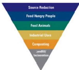
EPA Food Hierarchy

WalMart follows the EPA's food waste hierarchy that prioritizes 1) food for people, 2) food for animals, 3) food for the land (composting) and lastly, 4) food for disposal. Walmart donates any food suitable for consumption to food banks through the Feeding America program. The company currently recycles inedible fruit, vegetables, and baked goods in nine (9) of its Florida stores. The food waste is collected by Quest Recycling, which collects food for recycling from more than 3,000 WalMart stores nationwide. Quest transports the material to Organic Matters, a commercial food waste recycler, for processing into animal food and soil products for a wide range of agricultural applications.