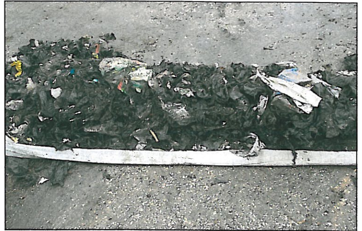
Airlift - Plastic removed and contained in discharge sock