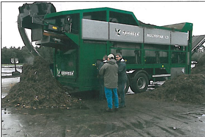
Komptech: Multistar L3 - Star Screen with Air Classifier