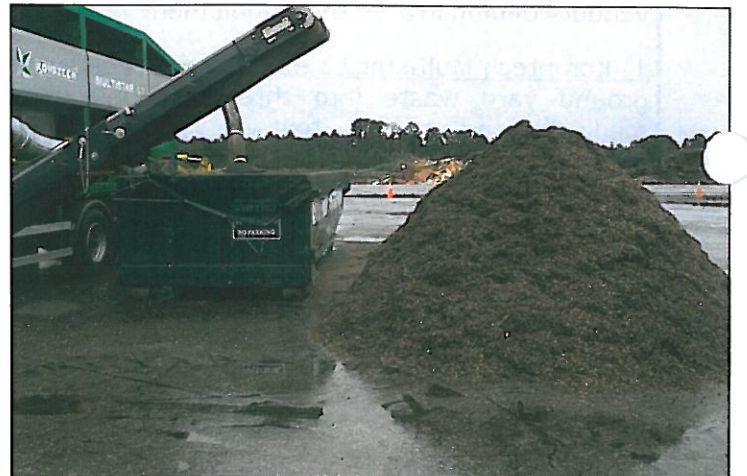
Komptech - End result (medium fraction) after processing fresh ground feedstock