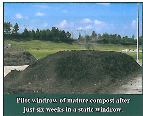
Pilot windrow of mature compost after just six weeks in a static windrow.

FORCE will continue to provide updates on this project in future newsletters.