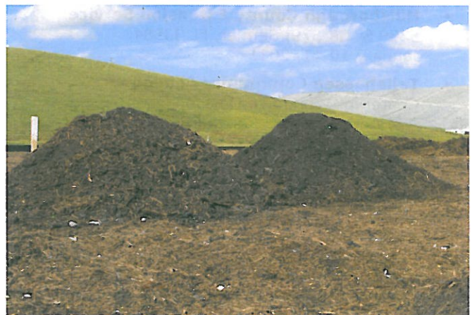
Constructed Pilot Piles