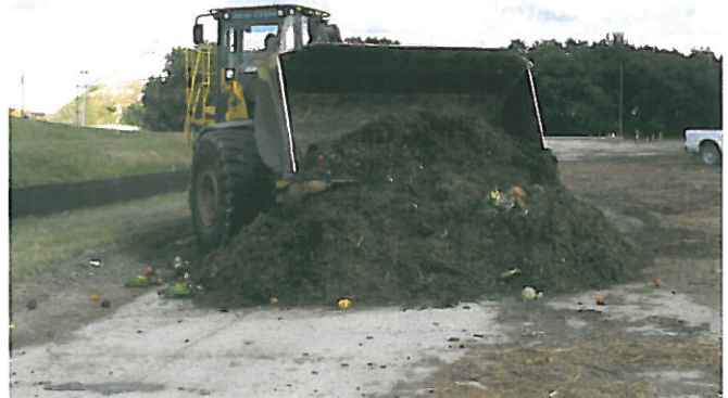
Mixing of pre-consumer food waste and yard waste