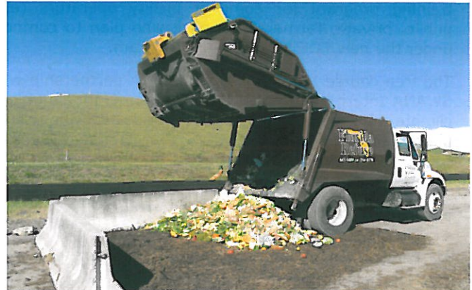
Receiving of pre-consumer food waste from Publix

The on-farm composting pilot has concluded as of November 2010. Final results are currently being compiled and analyzed, and will be featured in future issues of ForceMatters or on the FORCE website when available.